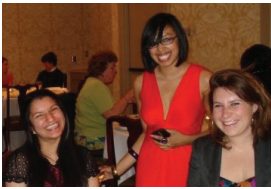
◀ Students founded the Independent Feminist Fund to support projects around campus